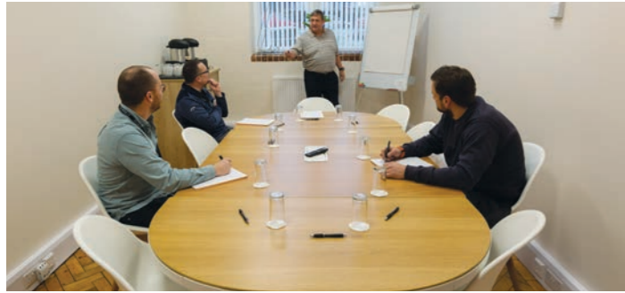
PENDLE & RIBBLE BOARDROOMS Half Day, £55 +VAT | Full Day, £90 +VAT

These bright and airy rooms can fit up to 10 people and are suited and booted with a large 4K display screen, ultrafast WiFi, whiteboard & flipchart plus refreshments and catering available if required.