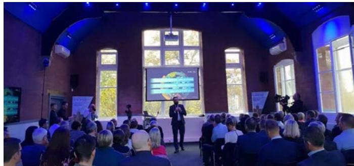
THE ASSEMBLY HALL Half Day, £175 +VAT | Full Day, £275 +VAT

Capacity: Theatre - 40 | U-Shaped - 18 | Boardroom - 12 | Classroom - 12