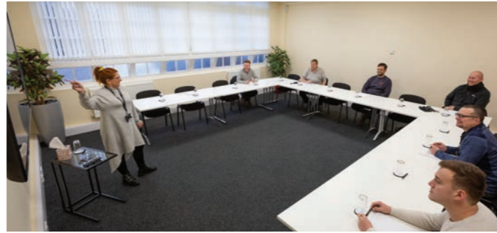
CALDER & BRUN SUITES Half Day, £80 +VAT | Full Day, £140 +VAT

These bright and airy rooms can fit up to 10 people and are suited and booted with a large 4K display screen, ultrafast WiFi, whiteboard & flipchart plus refreshments and catering available if required.