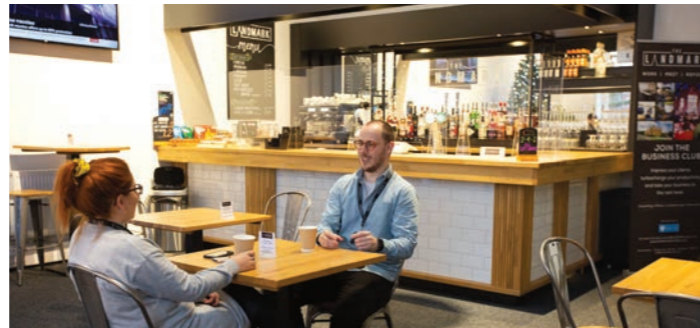
THE LOUNGE From £150 +VAT

A beautiful, atmospheric large hall with seating available for 100, makes this the perfect setting for large meetings, functions and lecture-style conferences. The Assembly Hall comes suited and booted with large 4K displays, conference phone, ultrafast WiFi and refreshments to keep you going.